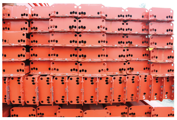
REB is qualified to help customers incorporate used material in their storage system. We only provide quality used products and will ensure that the right materials are used.