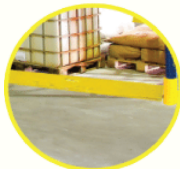
Down Aisle Protection