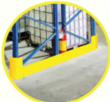
End of Row Protection